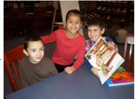
As part of the Kindergarten Reading Buddy Program at Bee Meadow School, second grade students read to the kindergarten students once a month in the media center.

learned the "Zero The Hero" song and dance to reinforce counting to 100. They made posters displaying 100 items. Poster contents ranged from pasta to cereal pieces to gummy bears.