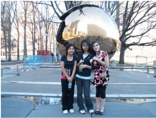
MJS students posing in front of a sculpture outside the UN