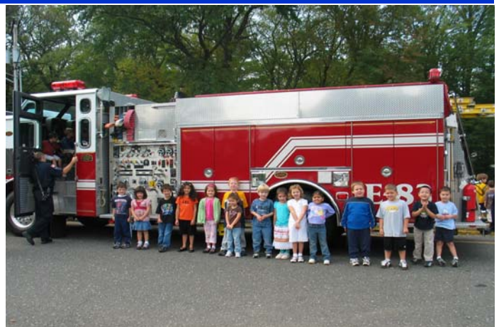
Whippany firefighters visited Salem Drive School to talk to kindergarteners about fire safety.