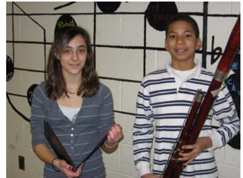
Two 7th grade students were selected for the North Jersey Regional Band and Chorus