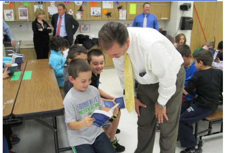
The Whippany Rotary distributed dictionaries to all district third graders on October 29, 2013, as part of their annual Dictionary Project. Pictured above are the third graders at Mountview Road School checking out their new dictionaries.