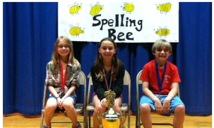
Pictured are the three finalists (winner is in the middle) of the district spelling bee, held at Memorial Junior School. All three are from Bee Meadow School! This is the third year in a row that BMS has won the district spelling bee.