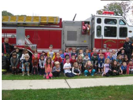
The Kindergarteners at Salem Drive School were treated to a visit by the Whippany Fire Department. They learned about fire safety, and had a chance to sit in the fire truck and work the fire hose. The students walked away with valuable safety information and understood how important firemen are to our community.